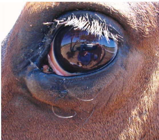
Presenting eye Marked swelling and inflammation

Outcome: After just one treatment of light therapy the swelling had gone down and the horse was much easier to work with and the eye was far less painful .