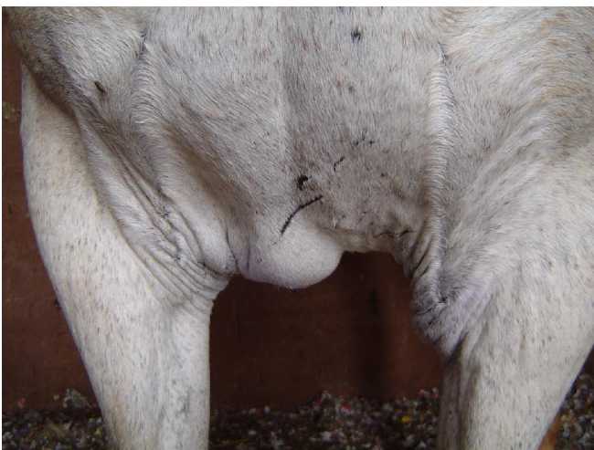
Presenting swelling / Edema between front limbs